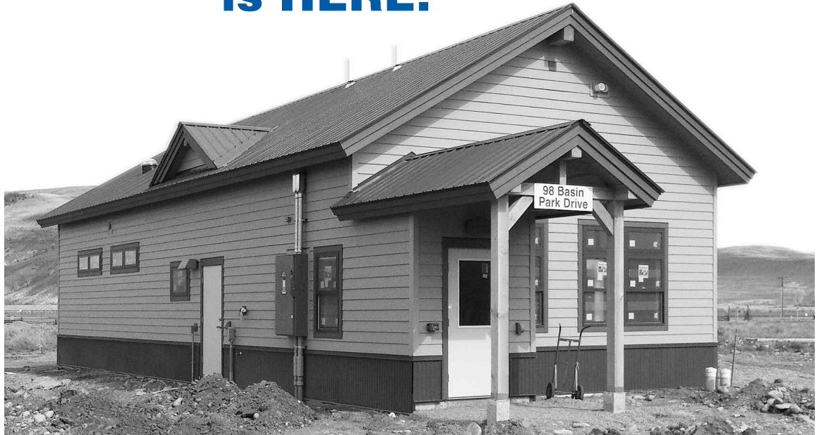
MacAllister Building Phase 1

The building, 1,300 sq ft, meets the Valley's essential needs, housing 15 cats and 9-11 dogs. GVAWL rescues an average of 110 companion animals each year, a number that will increase with shelter opening. The building also serves the City of Gunnison as its animal impound.